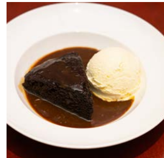
Sticky Toffee Pudding