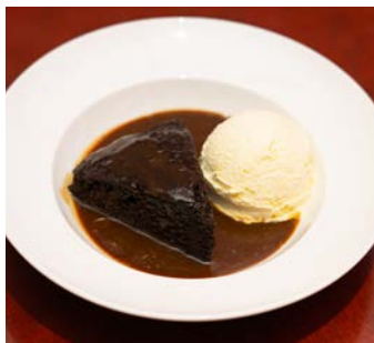
Sticky Toffee Pudding

*Cafe latte and cappuccino are available for an additional ¥100.